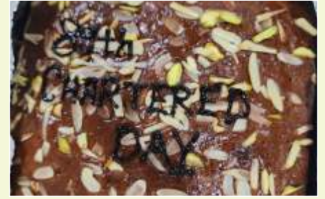
11th Nov - Club Charter day Celebrations