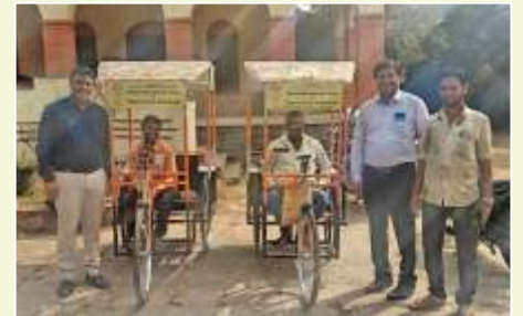
24 Nov. Tricycle Distribution