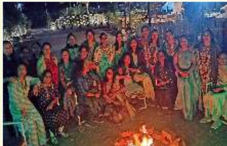
30th Nov. Fellowship Dinner