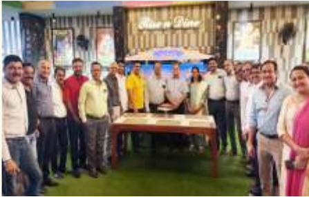
11th Nov - Club Charter day Celebrations