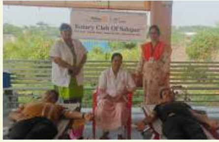
10th Nov. Blood Donation Nath Regency