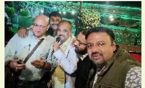
30th Nov. Fellowship Dinner