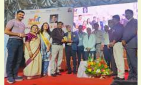
17th Nov. Felicitation of Club at Trf and International Service Seminar at Beed