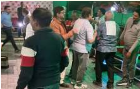
30th Nov. Fellowship Dinner