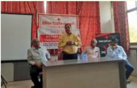
22nd Nov. Counselling of Anemic Students